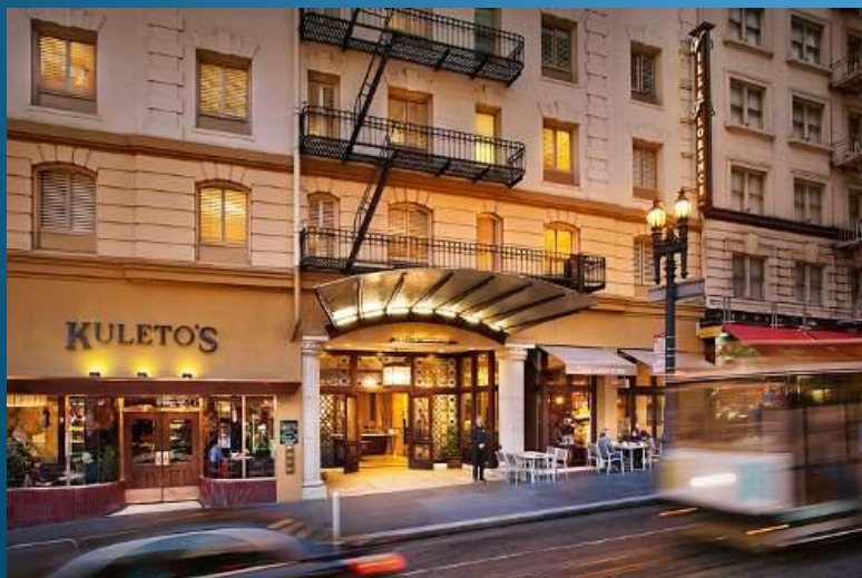
Villa Florence, San Francisco