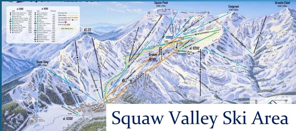
Squaw Valley Ski Area