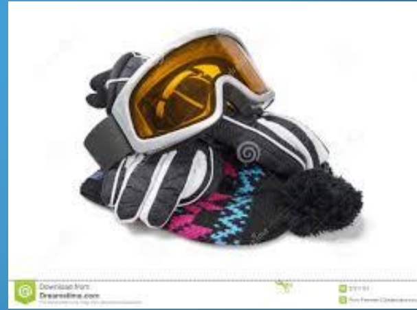
Gloves, Goggles & Hat