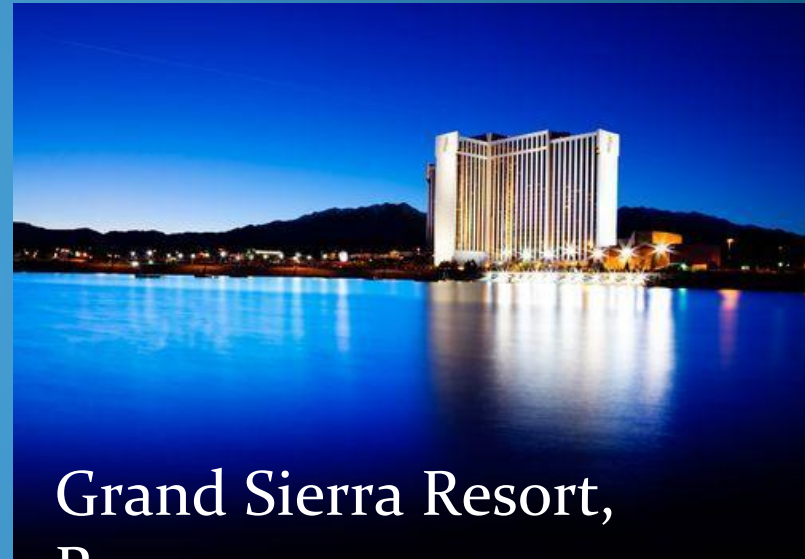
Grand Sierra Resort, Reno